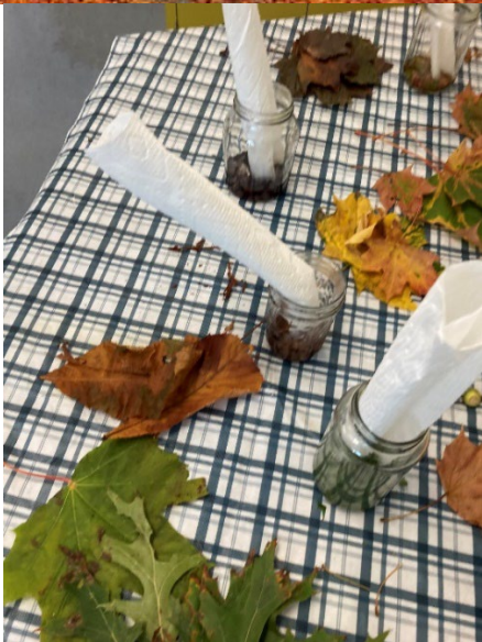
Figure 2 LALS Science experiment looks at how colour pigmentation in leaves changes during the Fall