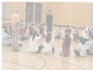
Figure 7 Metis-Lakota Cultural Knowledge Keeper leads the PE class in traditional games.

Thanks everyone for an incredible week of learning and for getting ready for the next one ahead!!